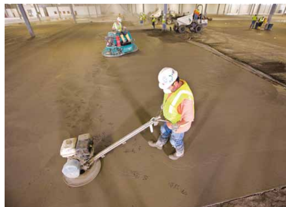
Long-term durability of the concrete surface can be accomplished with proper finishing techniques.

importance of concrete floor quality better than owners of food or perishable goods distribution facilities where there is demanding, round the clock floor traffic. In this environment, the benefits of a true quality floor quickly are seen. Food people will tell you that along with flatness, durability, abrasion resistance, and joint performance equal quality and longevity.