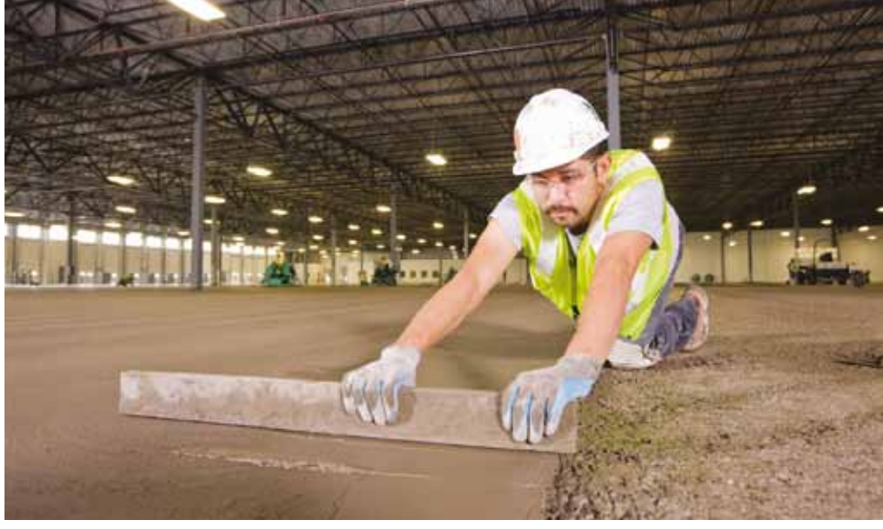
Flatness tolerances need to address the profile of the floor at construction joints.

Defining durability is simple. Durability is the ability of something to resist wear and tear. Measuring durability is difficult. Durability can't be measured with a machine or instrument for instant verification. It can't be seen or confirmed until after the floor is put to use. So the industry must use empirical knowledge and experience. For this, contractors must look to the people who own and operate facilities for feedback. A good source for this are people in the food industry. Yes, food. No one understands the