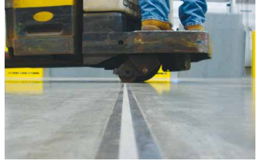
Properly designed and constructed joints are critical to achieving a durable floor.

Joints. Joints are usually the first area of a distribution floor to deteriorate,